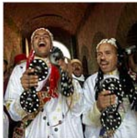
Rockin' the Casbah