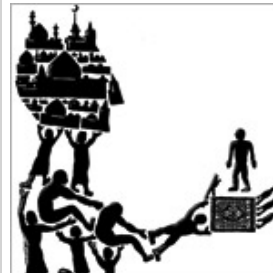
Op-Ed: President Apostate?